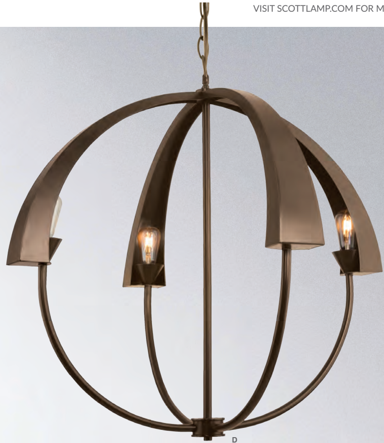
A MODEL 1420 Statuary Bronze H: 63" x Dia: 40" (4) Medium Base Socket, for LED A Style Bulb or Self-Ballasted CFL